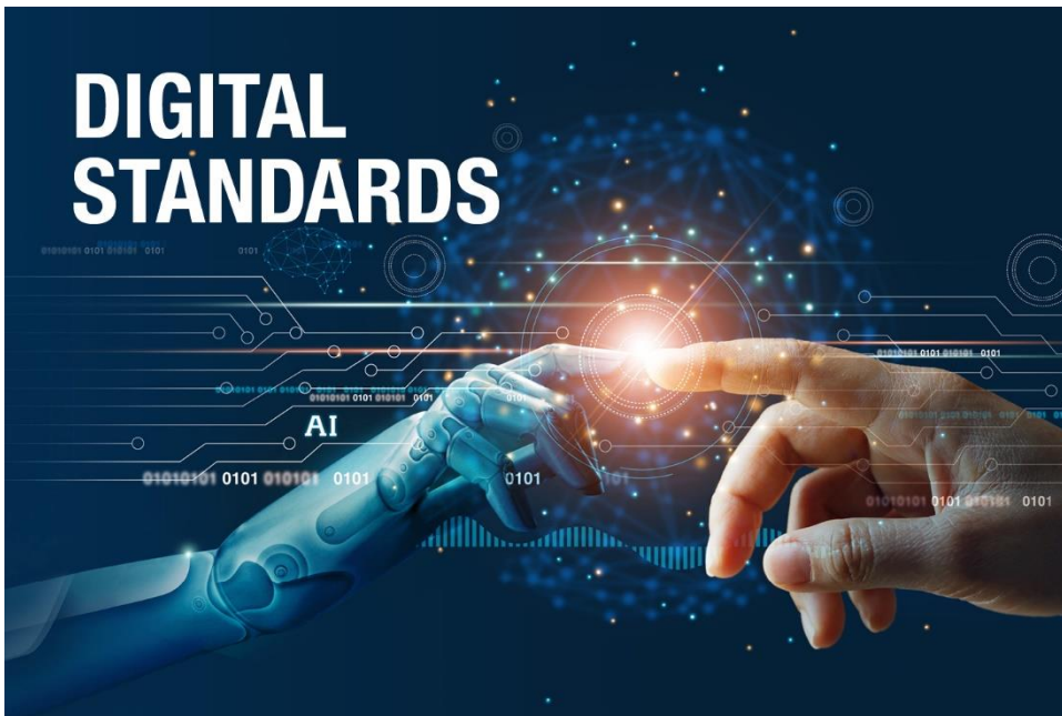
Figure 2: Key Visual Digital Standards