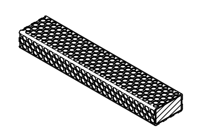
Scale - 2:1