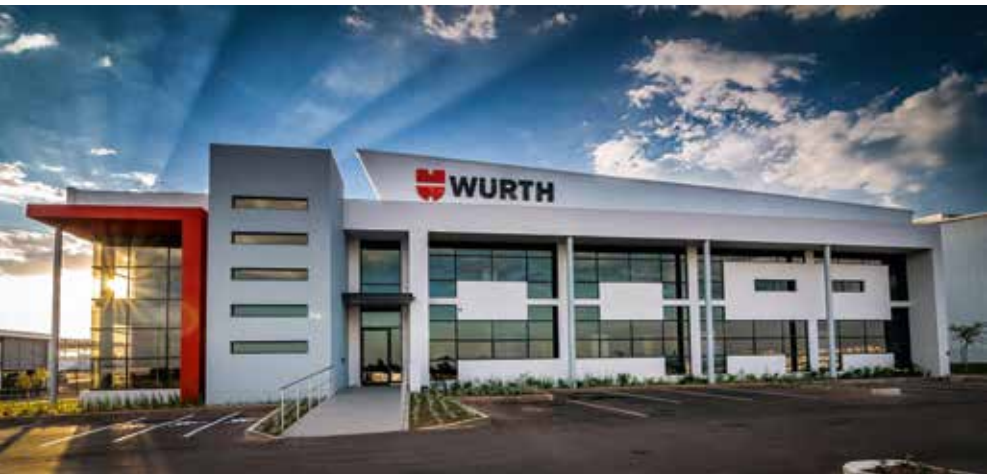
Würth South Africa (Pty.) Ltd. in Gauteng, Südafrika

In particular, we must exercise caution when collecting and processing personal data. We comply with the applicable data privacy and protection laws and appoint appropriate offices and positions to be responsible for compliance.