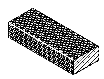
Scale - 2:1