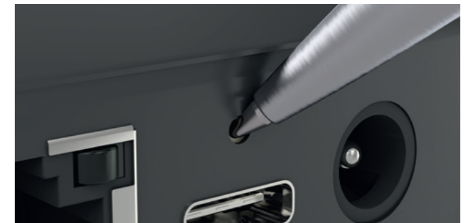
Special design of the push buttons' actuator tip (caved design) provides a perfect fix point for pen or other sharp tools while operation