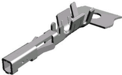
Figure 2: The standard crimp contact has a rigid contact sleeve.

The connection was disconnected ten times and the respective pulling forces required were measured. With a mean value of 0.22 N for the low-force crimp contact and an average pulling force of 1.2 N for the standard contact, there is a mean force reduction of 0.98 N.