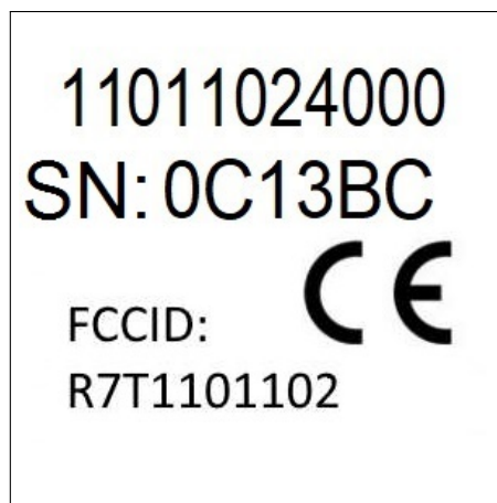
Figure 3: (Example) Proteus-III label containing the CE logo and the FCC ID R7T1101102

Please refer to the user manual of the standard radio module, chapter "General labelling information", to check which information can be placed on the module label.